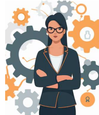
Time Chief Officer + Sectoral working groups