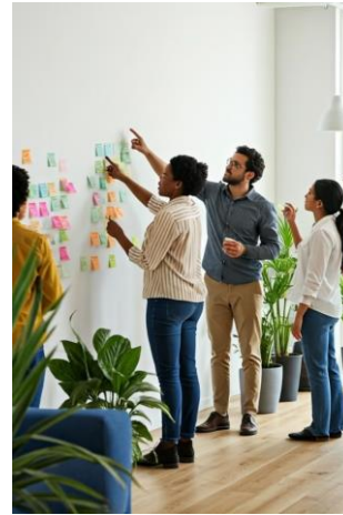
Time Policy Leadership Group